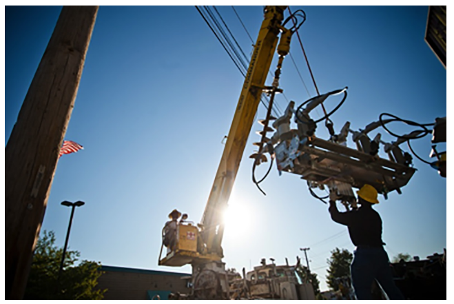
Installation of an IntelliRupter Fault Interrupter.

EPB's planning strategy for this deployment involved evaluating the number of customers per segment, load per segment, and the amount of overhead-line exposure per segment. That process resulted in